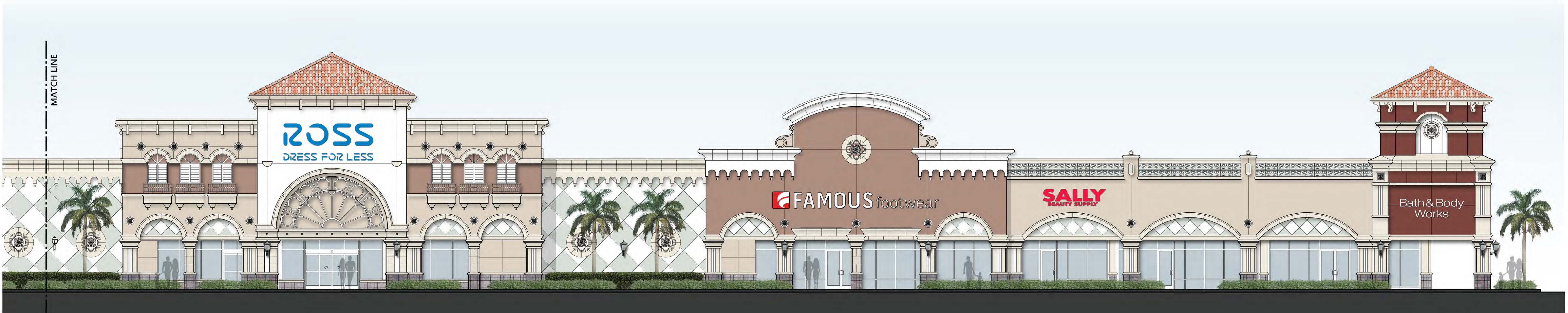
② Building 'A' - Partial North Elevation SCALE: 1/8"=1'-0"

DRAWING NOTES • THESE DRAWINGS ARE TO CONVEY DESIGN INTENT ONLY AND ARE NOT INTENDED FOR PERMITTING OR CONSTRUCTION PURPOSES. ALL DIMENSIONS SHOWN ARE FOR REFERENCE PURPOSES ONLY AND ALL INFORMATION, INCLUDING DIMENSIONS (SCALED OR OTHERWISE) SHALL BE VERIFIED IN THE FIELD PRIOR TO RELIANCE ON SUCH INFORMATION SHOWN OR OTHERWISE DERIVED FROM THESE DRAWINGS. • RADAKOVICH ARCHITECTURE ASSUMES NO LIABILITY RESULTING FROM RELIANCE ON THE INFORMATION SHOWN OR THE USE OF THESE DRAWINGS.